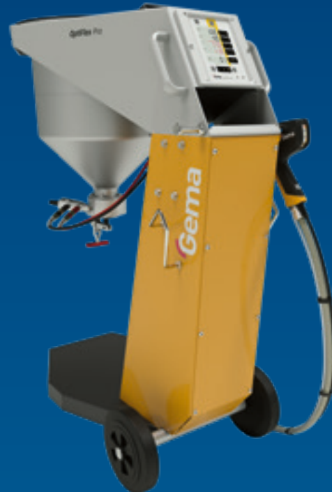
OptiFlex® Pro S