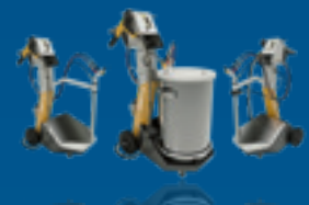
OptiSelect® Pro Type GM04 OptiStar® Type CG21 OptiFlex® Pro Manual coating equipment