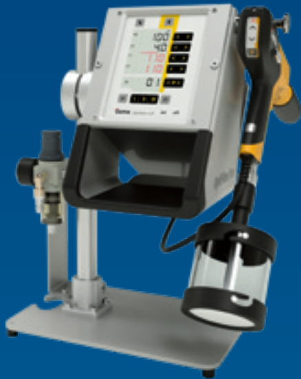
OptiFlex® Pro C