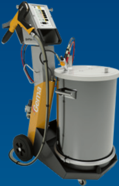
OptiFlex® Pro F