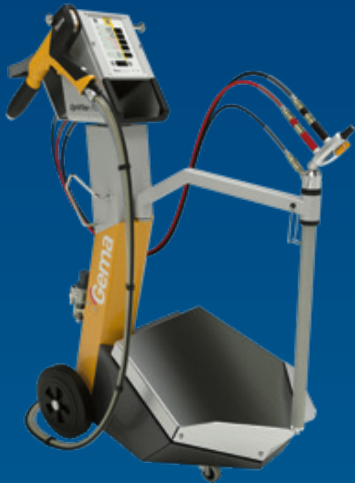
OptiFlex® Pro B