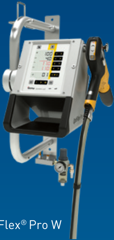
OptiFlex® Pro W