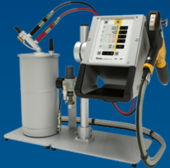
OptiFlex® Pro L