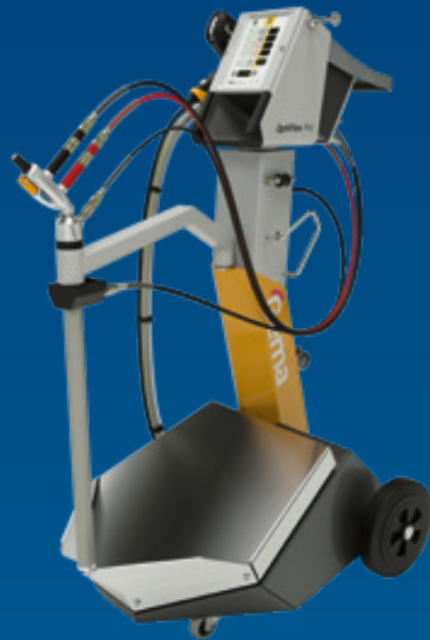
OptiFlex® Pro Q