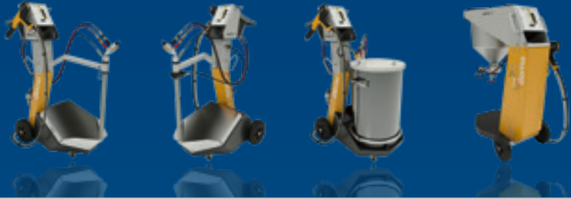
OptiFlex® Pro B OptiFlex® Pro Q OptiFlex® Pro F OptiFlex® Pro S